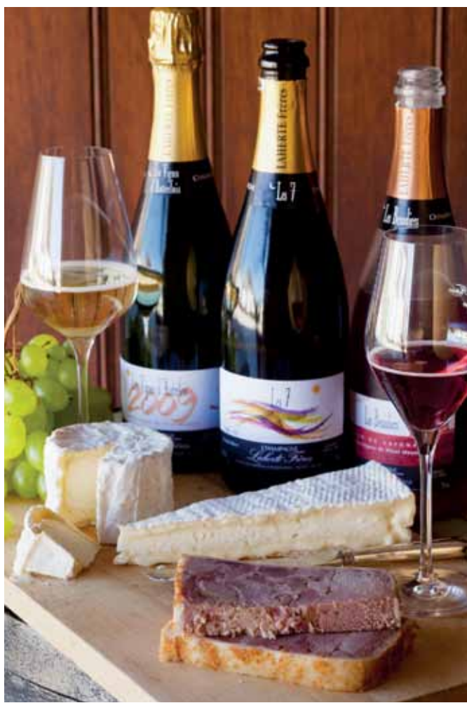
Left: Laherte Freres. Right: From left: Champagne "Vin d'Autre Fois" w/ Brie de Meaux, Champagne "Les 7" with Chaource, Champagne Rose "Les Baudiers" with Jambon de Reims/ Laherte Freres

Pinot Meunier with the pungent Chaource and the delicately perfumed Les 7 with the soft creamy Brie. But then, just for the heck of it, I switched them around and this worked perfectly well, too: the low-toned Brie provided a perfect stage for Les Vignes d'Autrefois to show its stuff and the understated finesse of Les 7 undercut the rustic intensity of the Chaource without even trying to compete with it, demonstrating that there are different ways to approach food and wine pairing.