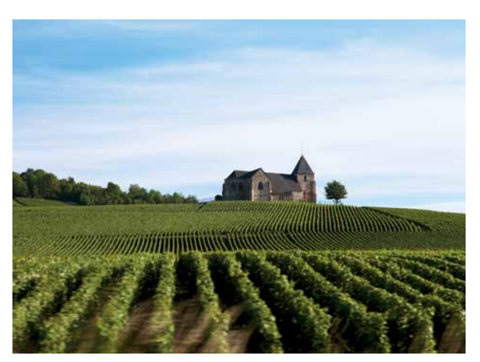
Chavot-Courcourt, France. Laherte Freres